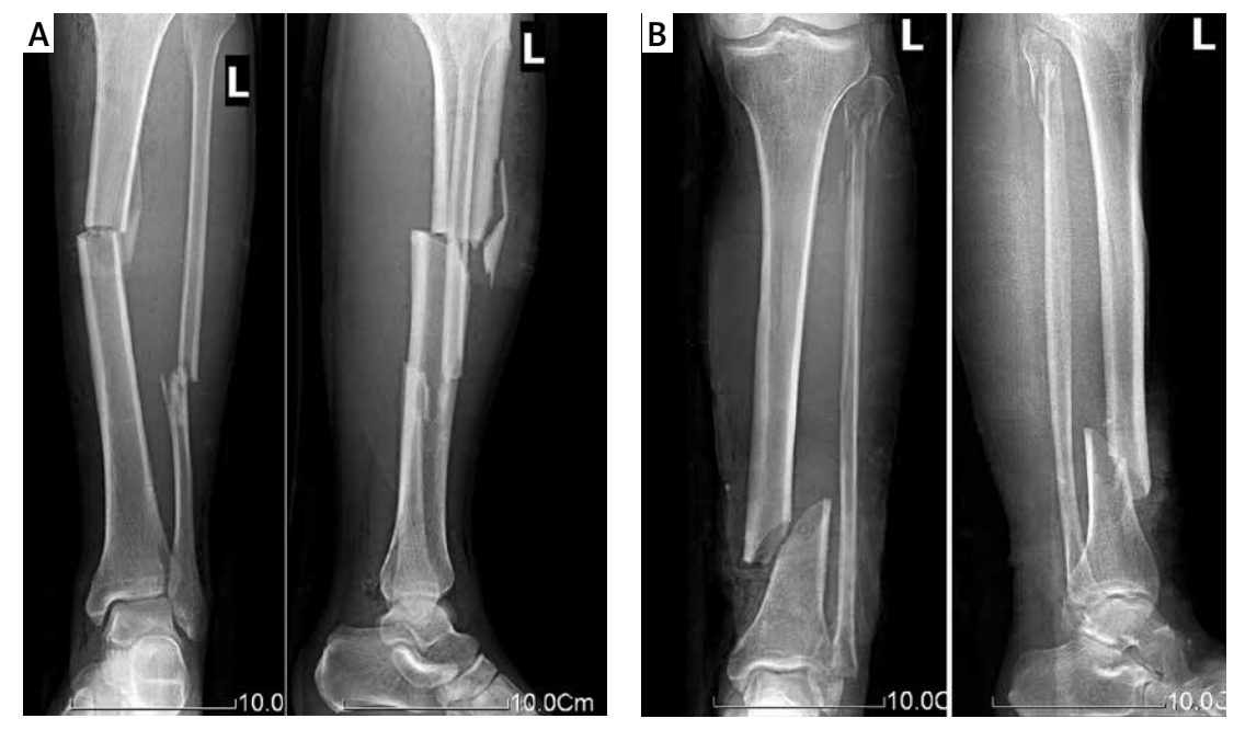
Figure 2. X-ray film of typical cases with open tibia and fibula fracture. A – Experimental group, B – control group